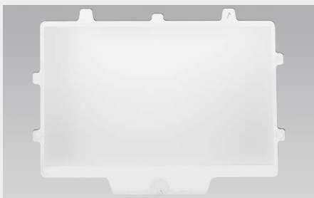
Molded part for intermediate image plane