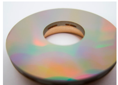
Injection mould insert with hole (feed point)